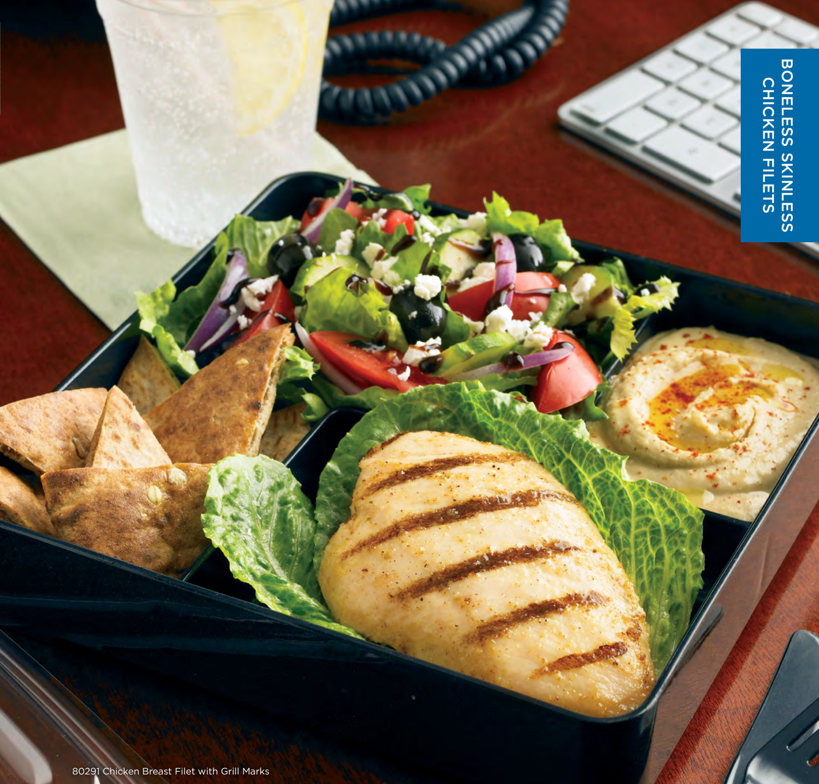
80291 Chicken Breast Filet with Grill Marks

TRENDY & TASTY CHOOSE FROM AN ARRAY OF DELICIOUS CHICKEN RECIPES TO SATISFY EVERY APPETITE